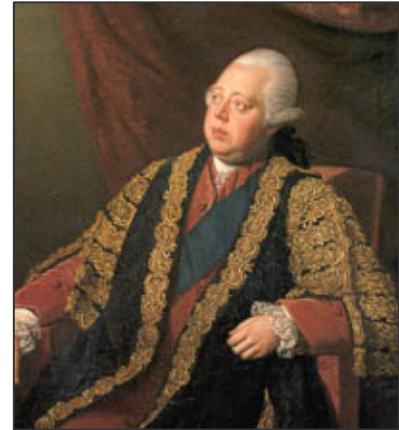
Lord Frederick North, Prime Minister of Great Britain during the Revolutionary War

Frederick North, most often known by the title of Lord North, was born on April 13, 1732, and died on August 5, 1792. Lord North was the Prime Minister of Great Britain from January 1770 to March 1782, during the majority of the Revolutionary War. In fact, he resigned in March 1782, as a result of the British defeat at Yorktown on October 19, 1781.