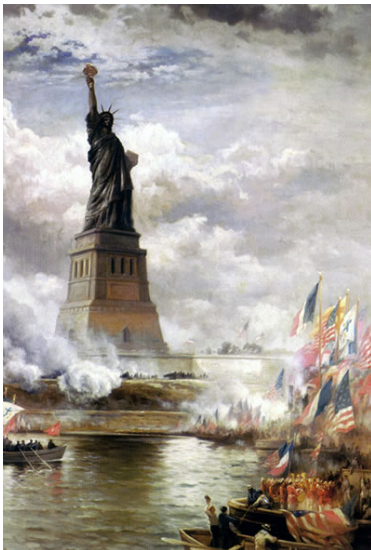
Liberty Enlightening the World

Liberty Enlightening the World. There is a reason why the Lord designed the earth so that there would be an Old World, meaning the Eastern Hemisphere, and then that there would be the discovery of the “New World.” Historically, and deceptively, the New World was soon thought to be the seat of redemption of mankind. It was thought by colonial America that the Lord’s spiritual healing of the world, or the redemption of the world, would come from the combined spiritual/political philosophies of the New World, reaching back to the Old World. We see this manifested later, for example, in the deliberate positioning of the Statue of Liberty, pointing back east to the Old World, with her official title of Liberty Enlightening the World. In the hearts of deceived men, she represents God’s light, vs. the Old World darkness of tyranny.