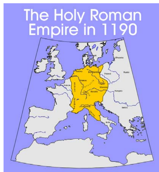
The Holy Roman Empire in 1190 at the time of the death of Frederick I Barbarossa

Along with England's Richard the Lionhearted and France's King Philip II, the Holy Roman Empire's Frederick Barbarossa led the Third Crusade to the Holy Land in 1189, but drowned on the expedition the next year while crossing a river. [Beginning a century before, in 1095, Byzantine Emperor Alexius Comnenus asked Urban II, Pope of the Roman Catholic Church, for