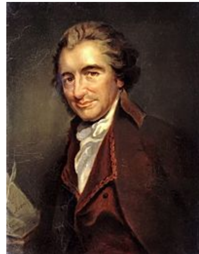
Thomas Paine, American Revolutionary and French Revolutionary

The Double Paine Revolutions. Most historians consider the French Revolution of 1789 to be a double of the American Revolution of 1776, though Christians in America would deem the French Revolution to be a “godless” revolution, while deeming the American Revolution to be a “godly” revolution. The Lord’s stand on the matter is that the “godless” French Revolution is to be seen as a double of the “godless” American Revolution. A man that connects both together is Thomas Paine . Paine’s writings, such as one titled Common Sense , greatly influenced the political thinking of the leaders of the American Revolution , and he then later became a famous figure in Paris during the French Revolution . “I know not”, wrote former President John Adams in 1806, “whether any man in the world has had more influence on its inhabitants or affairs for the last thirty years than Thomas Paine.” [The name Thomas itself means “double” or “twin”.] In January 1776, Paine published his pamphlet Common Sense , a statement on the colonists’ cause. This pamphlet demanded complete independence from Great Britain. Paine asserted that the American Revolution would begin a new era in world history. “The birthday of a new world is at hand,” he wrote. Washington, Jefferson, and other colonial leaders read it with approval. Common Sense became the most widely circulated pamphlet in American history up to that time.