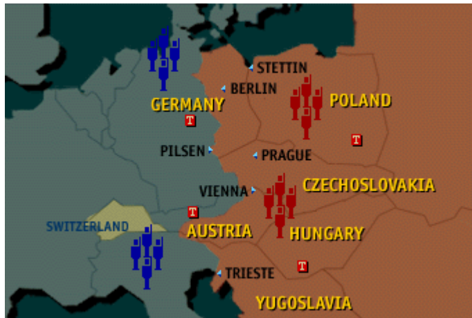
Map of Europe in 1945 after World War II, illustrating the coming East-West Cold War division of the world between Communism and Democracy

Most Christians have not heeded “ set your affections on things above, not on things on the earth ” (Col. 3:2), and so, like the natural man, are ripe for the good-evil deception. They believe that the Lord founded America as his “good” earthly “Christian” kingdom as the alternative to Satan’s “evil” governmental systems of political “tyranny.” Thus, many professing followers of Jesus have resisted the “evil” empire of Communism with the “good” of American democracy. In truth, both the “evil” of Communism and the “good” of Democracy are of Satan.