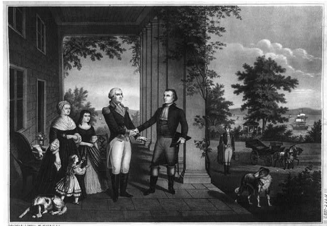
General Lafayette's departure from Mount Vernon 1784

Marquis de Lafayette. Marquis de Lafayette was a French soldier and statesman who significantly helped the Americans defeat the British in the Revolutionary War. He became a major general in the American Army, persuaded France to send military aid to the colonists, helped Washington in forcing British General Cornwallis to surrender at Yorktown, and assisted in the negotiations that won American independence.