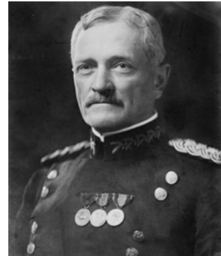
General John J. Pershing