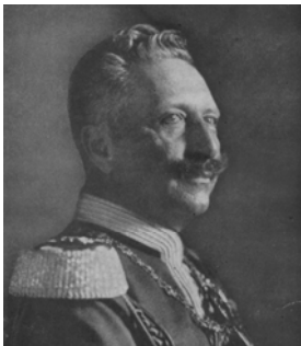
Kaiser Wilhelm II and Germany in World War I represent a final part of the Daniel 2:40 Legs of Iron.

Since we have already seen that Hitler’s Third Reich Germany and Stalin’s USSR are a part of the Daniel 2:41-43 Feet and Toes, then we are to see that those same empires represent a Feet and Toes extension of the Roman Empire, though more detached from the original Roman Empire than were the German-Austrian Empires and “Third Rome” Russian Empire that were a part of the Legs of Iron, and which preceded them.