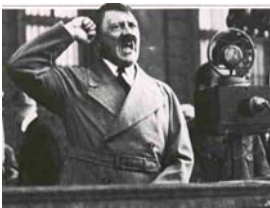
Adolf Hitler and Nazi Germany in World War II represent the Daniel 2:41-43 Feet and Toes of Clay .