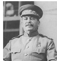
Joseph Stalin and the Soviet Union in World War II represent in Daniel 2:41-43 the Feet and Toes of Iron .