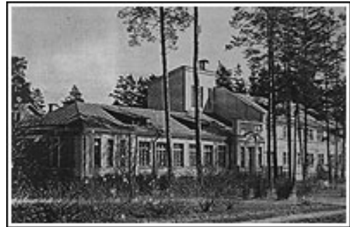
Residence of the German rocket team in the village of Mamontovka near Moscow circa 1947

Key Understanding: The mixture of Germany, the U.S., and the USSR in the space race. The same three nations of Germany, the United States, and the Soviet Union that are seen in the prophetic outworking of Daniel 2:41-43, because of the combination of World War II and the Cold War, are also seen in Revelation 17:10-11, through the Space Race. The point is that the Lord emphasized the role of space with the intermingling of Germany, the United States, and the USSR, in fulfillment of “a short space” in Revelation 17:10.