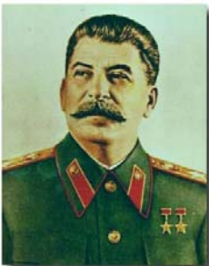
USSR – strong iron