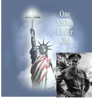
U.S. – strong iron