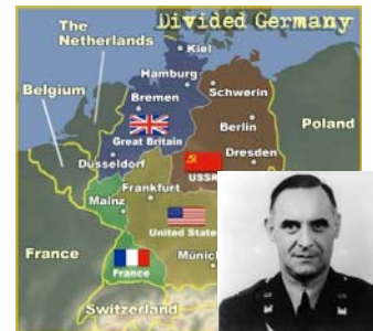
Germany – broken clay

Germany was a ‘Pact of Steel’ Strong Iron Foot when it invaded and occupied a Broken Clay France in June 1941. But then on May 7, 1945, at 2:41 a.m., Germany surrendered and became a Broken Clay Foot when crushed by the Allied Strong Iron Foot of the U.S./USSR.