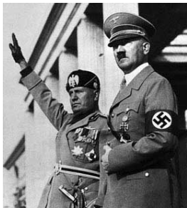
Germany – strong iron

Daniel 2:43 (KJV) And whereas thou sawest IRON MIXED with miry CLAY, they shall mingle themselves with the seed of men: but THEY [U.S. vs. USSR in the Space Race, represented by the October 4, 1957, launch of Sputnik] SHALL NOT CLEAVE ONE TO ANOTHER , even as IRON is NOT MIXED with CLAY.