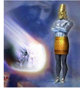
U.S. – broken clay

The United States plays the role of the Strong Iron Foot in its defeats of both Third Reich Germany in World War II and the Soviet Union in the Cold War. The United States becomes the Broken Clay Foot when crushed by the Revelation 19:15 Rod of Iron Ruler.