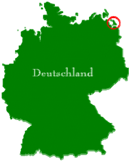
A map of Germany with the red circle illustrating the general location of Peenemunde

In Unsealing #123 The Short Space Kingdoms – The V-2 Rocket: Broken Clay Germany’s Role in the U.S. vs. USSR Space Race , we discussed Germany’s development of the V-1 and V-2 rockets. It was at a site called Peenemunde in Germany that the Germans developed the V-1 and V-2 rockets.