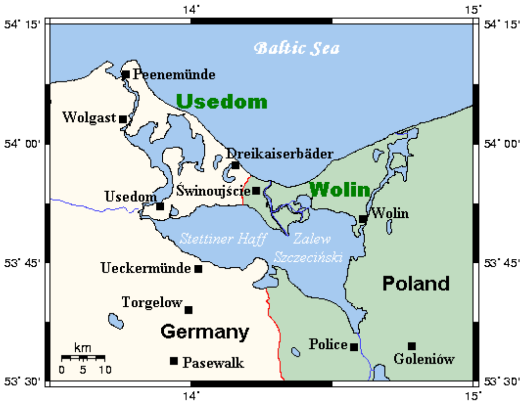
Peenemunde on the island of Usedom

Peenemunde is a village in northeast Germany located on the Baltic Sea at the mouth of the Peene River on the island of Usedom. It was originally a quiet, wooded region, but came to the attention of the German Army and Luftwaffe in their search for a new rocket development site. The site was actually suggested to Wernher von Braun by his mother. Peenemunde, since it was located on the coast, permitted the launching of rockets, and their subsequent monitoring, across about 200 miles of open water.