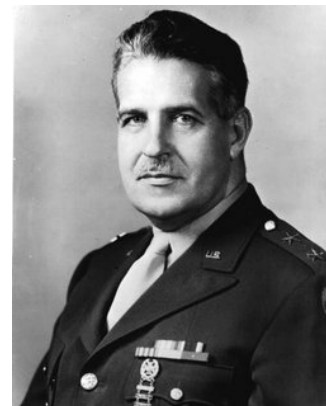
Director of the Manhattan Project, Leslie Groves

Most in the world would say that America's status today as the lone superpower, with military prowess matched by none, can be traced to its being the first to develop the atomic bomb. The project to develop the atomic bomb, of course, was named the Manhattan Project. The director of the Manhattan Project was Leslie Groves. In his book Now It Can Be Told: The Story of the Manhattan Project , Groves writes, “The office out of which I was to control