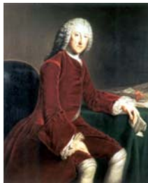
William Pitt, born in 1708

The Lord ordained that America’s ascension out of Pitt’s England would be integrally associated with Pitt, who was born in 1708 , for the purpose of verifying and clarifying that America is the Beast in Revelation 17:08 that is arising out of the pit.