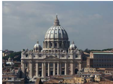
St. Peter's Basilica, Rome

The Seven Hills of Rome. Many have felt that the Lord is giving a clue that since Rome sits on seven hills, the woman of Revelation 17:09 that is sitting upon seven heads which are seven mountains (KJV), or hills (NIV), must be the Roman Catholic Church.