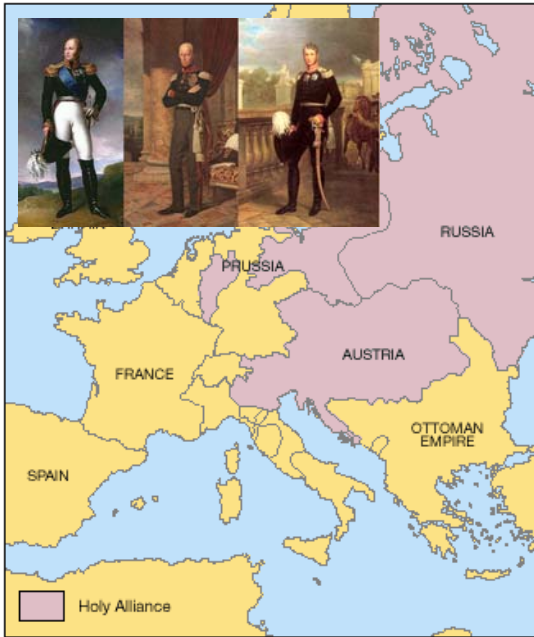
The Holy Alliance of Russia, Austria, and Prussia (Germany) in 1815

The United States became the Fourth Christian Roman Empire of its day