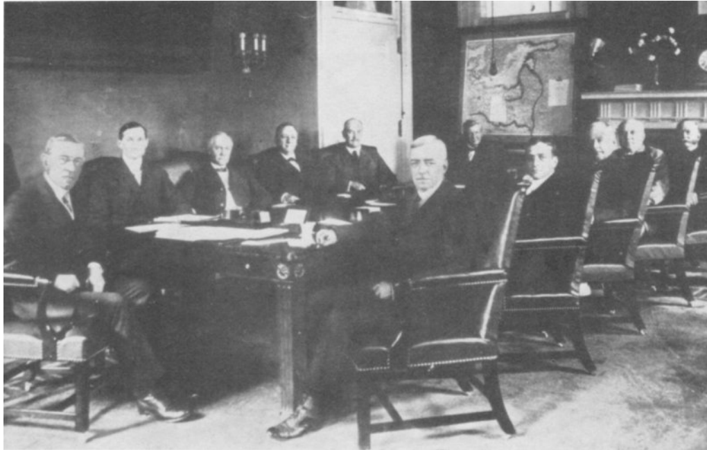
President Woodrow Wilson and His War Cabinet. Left —W. G. McAdoo, Secretary of the Treasury; Thomas W. Gregory, Attorney General; Josephus Daniels, Secretary of the Navy; D. F. Houston, Secretary of Agriculture; William B. Wilson, Secretary of Labor. Right —Robert Lansing, Secretary of State; Newton D. Baker, Secretary of War; A. S. Burlinson, Postmaster General; Franklin K. Lane, Secretary of Interior; William C. Redfield, Secretary of Commerce.

Excitement was spreading over the country, fed by newspaper reports and editorials, and a statement by former President Theodore Roosevelt demanding an immediate declaration of war. President Wilson met with Secretary of State Lansing on March 19, and called a Cabinet meeting to be held on March 20 to discuss the issue of the United States going to war against Germany.