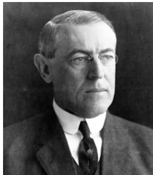
U.S. President Woodrow Wilson