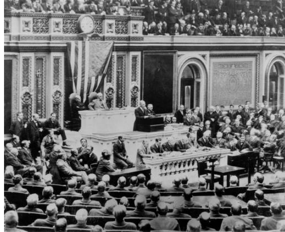
President Woodrow Wilson delivering his “the world must be made safe for democracy” speech to Congress on April 2, 1917

fiery trial and sacrifice ahead of us. It is a fearful thing to lead this great peaceful people into war, into the most terrible and disastrous of all wars, civilization itself seeming to be in the balance. But the right is more precious than peace, and we shall fight for the things which we have always carried nearest our hearts -- for democracy, for the right of those who submit to authority to have a voice in their own governments, for the rights and liberties of small nations, for a universal dominion of right by such a concert of free peoples as shall bring PEACE AND SAFETY to all nations and make the world itself at last free. To such a task we can dedicate our lives and our fortunes, everything that we are and everything that we have, with the pride of those who know that the day has come when America is privileged to spend her blood and her might for the principles that gave her birth and happiness and the peace which she has treasured. God helping her, she can do no other.”