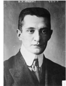
Kerensky represented the 8 th kingdom, the U.S.

Key Understanding: Lenin and Kerensky represent the 7 th and 8 th kingdoms, respectively. The Lord’s purpose in constructing doubles surrounding Kerensky and Lenin, the leaders of the Double Russian Revolutions of 1917, is to point to the close relationship between the Double ‘Births’ of Kingdoms at that point in time, meaning the 7 th and 8 th Kingdoms of Revelation 17:10-11. The 7 th would represent Soviet Communism. The 8 th would “Make the World Safe for Democracy.”