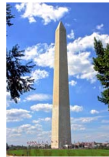
The Washington Monument, representing the uprooting of the third horn, Spain-Mexico

Key Understanding: The fifth, fifth, fifth beast. As concerns the rise of the ‘Little Horn’ Fifth Beast, there are obvious bookends of “Washington to Washington.” George Washington was the key person in the uprooting of Great Britain, the first horn, to begin the fulfillment of the prophecy of Daniel 7:8. Then, the monument to honor George Washington for his uprooting of the first horn – the 555-foot-tall Washington Monument – had its cornerstone laid on July 4, 1848, the day of the uprooting of the third horn, Spain-Mexico, which was providing an ending to the fulfillment of the prophecy of Daniel 7:8.