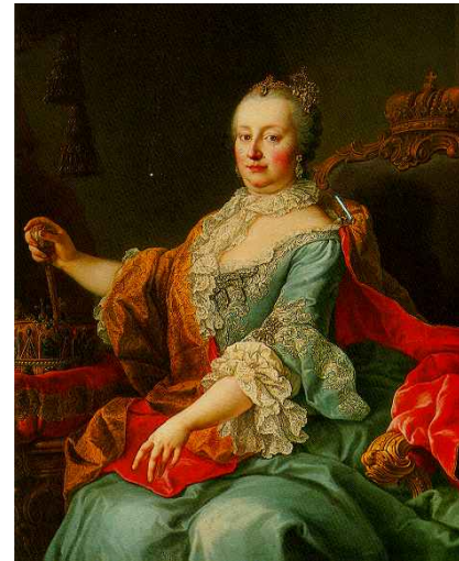
Maria Theresa of Austria

[Silesia was a region located mostly in what is today’s southwestern Poland. Austria had taken over Silesia in 1526, but Prussia seized northern Silesia from Austria in 1742, shortly after Maria Theresa had taken the throne in 1740. She was the only female to rule during the 650-year-long Habsburg Dynasty.]