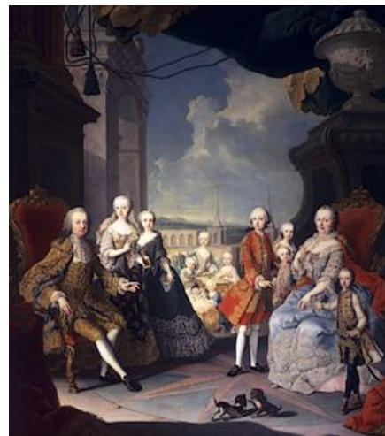
The painting The Royal Family on the Terrace of Schönbrunn Castle (Academy of Fine Arts, Vienna) shows Empress Maria Theresa, Archduchess of Austria, Queen of Bohemia and Hungary, in her family circle.

Key Understanding: The ten horns out of which America arose. The Seven Years’ War, known as the French and Indian War (1754-1763) in America, produced the Ten Horns of Daniel 7:7. America arose as the ‘Little Horn’ Fifth Beast of Daniel 7:8 out of the Seven Years’ War (1756-1763), as it was known in Europe, which was a war among ten major European powers, three of which were Great Britain, France, and Spain.