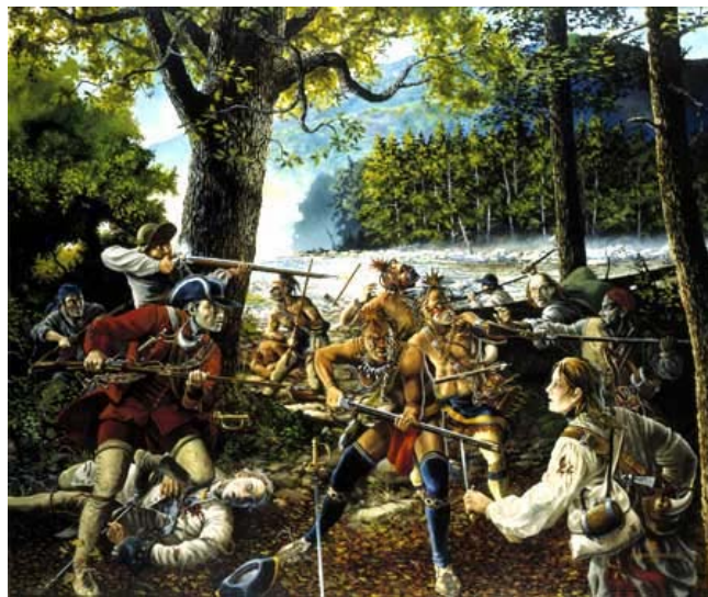
1756 - French and Indian War - "20 Brave Men"

Daniel 7:8 (KJV) I considered THE [Ten] HORNS [connected with the French and Indian War (1754-1763) / Seven Years' War (1756-1763)], and behold, there came up among them another LITTLE HORN [a Fifth Beast, the United States of America], before whom there were THREE OF THE FIRST HORNS [England, France, and Spain, uprooted by Mexico, which was then uprooted by the United States in the 1846-1848 Mexican War] PLUCKED UP BY THE ROOTS : and, behold, in this horn were eyes like the eyes of man, and A MOUTH SPEAKING GREAT THINGS .