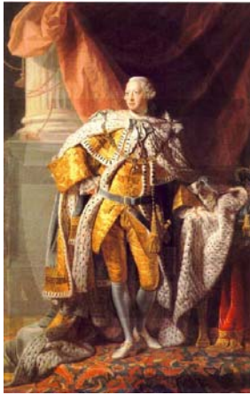
King George III

Key Understanding: The crown shift from King George III to George Washington. Obviously, the spirit of the ‘Bill of Rights’ Ten Horns Crown Shift seen in Revelation 13:1 is exemplified through the Crown Shift of America from King George III, who is the culprit in the Declaration of Independence, to George Washington, who refused to become a king, and instead would become the first president (on April 30, 1789).