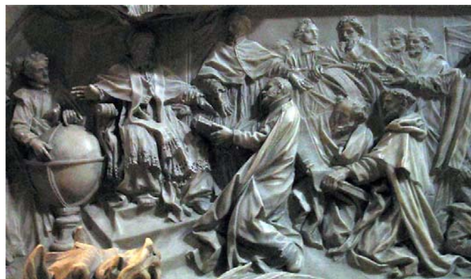
Detail of the tomb of Pope Gregory XIII celebrating the introduction of the Gregorian calendar

The Gregorian calendar. The calendar that is used by most of the world today is called the Gregorian calendar. It is named after Roman Catholic Pope Gregory XIII, who established it in 1582 to correct the Julian calendar, which had been used by most of the world since it was put into effect in 46 B.C. The Gregorian calendar of 1582 represents the major “time change,” or calendar change, in the modern history of the world.