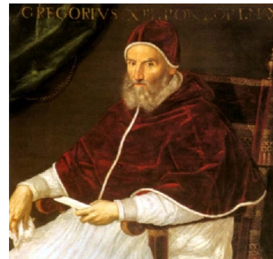
Pope Gregory XIII

Key Understanding #2: The changing of times to the Bill of Rights is prophetically connected to the changing of times to the Gregorian Calendar. We will be seeing that the Daniel 7:25 “think to change times” through the December 15, 1791, Bill of Rights is confirmed by history’s October 4, 1582, Gregorian calendar “time change.”