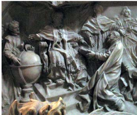
Detail of the tomb of Pope Gregory XIII celebrating the introduction of the Gregorian calendar

Key Understanding: 209 years from the time change to the Bill of Rights. First, the number 209 is used by the Lord to denote a “double” or a “double portion of the spirit.” [Reference Unsealing #159.] Secondly, the Gregorian calendar “time change” of October 4, 1582, initiated (a) a 2-month change in the beginning of the year, and also (b) an 11-day date change when it came into use in Britain and the British colonies in 1752. Now let’s put the two together. October 4, 1582, was exactly 209 years + 2 months + 11 days before the December 15, 1791, Bill of Rights, which was a primary fulfillment of “think to change times” in Daniel 7:25. In fact, the Lord’s exact “time change” use of 2 months and 11 days to fulfill the prophecy is further evidence of the fulfillment of the prophecy.