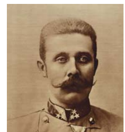
Austrian Archduke Ferdinand, assassinated to spark World War I

Key Understanding: The Russian successor and the Austrian successor. We now see the United States as (a) the Russian Successor, that is, the 'Fourth Rome' Christian Empire Successor of the 'Third Rome' Russian Orthodox Empire, and (b) the Austrian Successor, that is, the successor to Austria as the seat of a demonically-anointed 'One Nation Under God' Holy Christian Empire of the West.