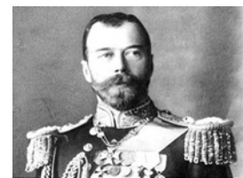
Russian Tsar Nicholas II, executed during World War I