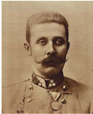
Austrian Archduke Franz Ferdinand

We are setting up later understandings with this Unsealing. The theme of Prince was totally connected with the theme of the Austrian Successor in World War I.