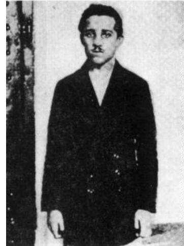
Gavrilo Princip, assassin of Austrian Archduke Franz Ferdinand

The Princes of World War I. World War I was triggered by the June 28, 1914, assassination in Sarajevo of the Austrian Archduke Franz Ferdinand , heir presumptive to the throne of the Austrian-Hungarian Empire. Franz Ferdinand was Prince Imperial of Austria, and Prince Royal of Hungary and Bohemia. His assassin was a Bosnian Serb, Gavrilo Princip , whose name happens to mean Prince . Princip was committed to the independence of the Southern Slavic people (Yugo Slavs) from the Austrian-Hungarian Empire. A month later Austria would declare war on Serbia, beginning World War I.