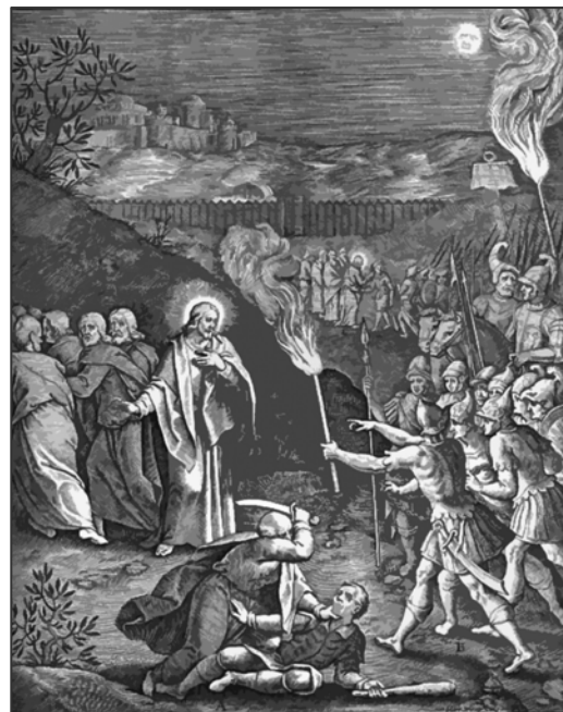
An artist’s depiction of Peter drawing the sword

It is clear that there was a direct relationship between the condition of Peter’s heart when he drew the Sword (John 18:10-11), and his willingness to deny Jesus Christ (John 18:17, 25-27). Jesus had warned Peter of this (John 13:37-38), knowing that Peter himself was not spiritually ready for his own cross.