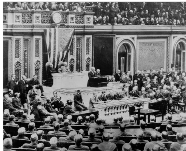
President Woodrow Wilson delivering his “the world must be safe for democracy” speech to Congress on April 2, 1917

“A steadfast concert for peace,” the President said, “can never be maintained except by a partnership of democratic nations. No autocratic government could be trusted to keep faith within it or observe its covenants.” Hence the assurance for the future peace of the world that had come with the recent wonderful news of what occurred in Russia. Wilson continued, “now it [the Romanov autocracy] has been shaken off and the great, generous Russian people have been added in all their naive majesty and might to the forces that are fighting for freedom in the world, for justice, and for peace. Here is a fit partner for a league of honour.”