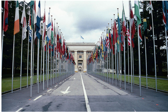
The League of Nations

Wilson’s words that “the world must be made safe for democracy” became known to all in the U.S. as the reason for America’s entrance into World War I.