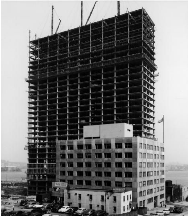
The steps outlined on this page were steps in the founding and construction of the United Nations. Later ( above ) would come the actual construction of the United Nations buildings in 1949 and 1950 on the east side of Manhattan.

Step 4, Declaration by United Nations, January 1, 1942. The term “United Nations” was first suggested by Franklin D. Roosevelt during World War II, to refer to the Allies. The first official use of the words United Nations was in the January 1, 1942, Declaration by United Nations, which committed the Allies (also thus called the “united nations”) to the principles of the Roosevelt-Churchill Atlantic Charter and pledged them not to seek a separate peace with the Axis powers. It was later signed by 21 other nations. Thereafter the Allies used the term “United Nations Fighting Forces” to refer to their alliance against Hitler’s Third Reich. By this time, the U.S. had entered the war on December 8, 1941, in response to the Japanese attack on Pearl Harbor the previous day.