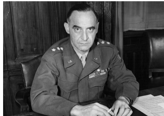
American General Lucius Clay

Unsealing #138 Crushing the Feet of Clay – The Roles of General Lucius Clay, part 4, General Lucius Clay represents America becoming Broken Clay