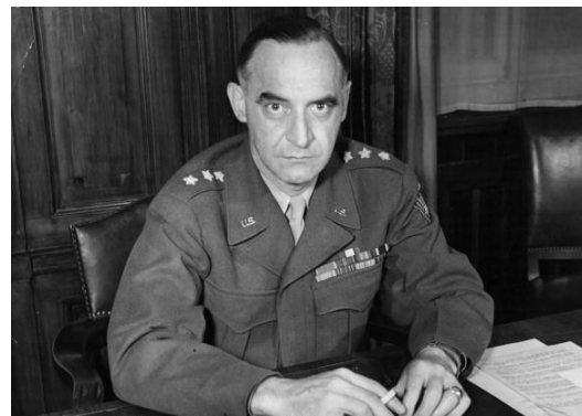
American General Lucius Clay

Unsealing #138 Crushing the Feet of Clay – The Roles of General Lucius Clay, part 4, General Lucius Clay represents America becoming Broken Clay