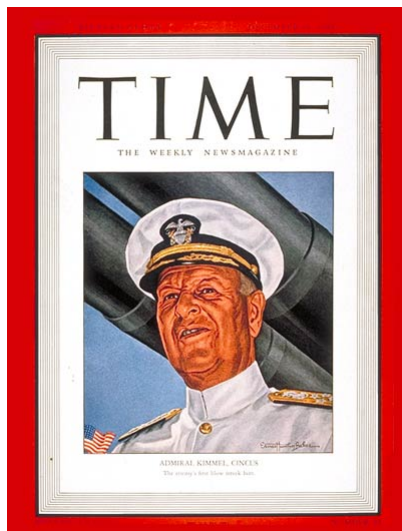
Husband Kimmel on the cover of Time , December 15, 1941

“Oh, what a doleful sight!” The morning of December 8 brought home the full horror of the previous day at Pearl Harbor. Husband Kimmel paced the floor of his office in distress. From time to time he walked to the window and looked out on the dismal scene in Pearl Harbor. “Oh what a doleful sight!” he repeated. “Oh, what a doleful sight!”