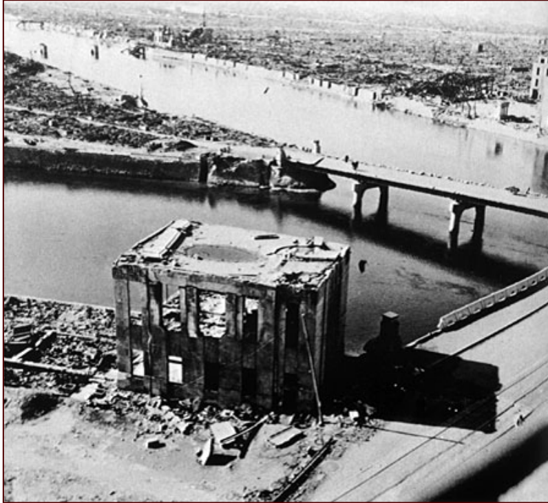
On August 6, 1945, the Red Cross building ( above ) in Hiroshima was close to the hypocenter and did not fare well. But the beast was healed ( below ).