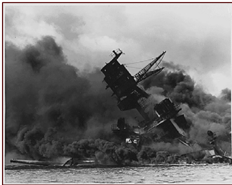
December 7, 1941: the deadly wound to the beast

Revelation 13:3 (KJV) And I SAW ONE OF HIS HEADS [the 7 th Head or Kingdom, Germany’s Third Reich] AS IT WERE WOUNDED TO DEATH [by the 8 th Kingdom, the Beast, partially reflected through