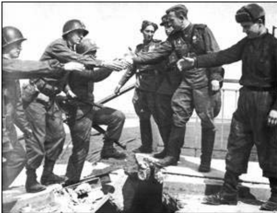
April 25, 1945 – East meets West. Eight Russian armies completely encircled Berlin, linking up with the U.S. First Army patrol, first on the western bank of the Elbe, then later at Torgau. Germany had become, for all intents and purposes, Allied territory.

Daniel 2:42 (KJV) And as the TOES OF THE FEET were part of IRON [Eisenhower – the Man of Iron – representing the western Allies of America-Britain-France, and Stalin – the Man of Steel – representing the Soviet Union], and part of CLAY [Hitler’s Germany at 2:41 a.m., May 7, 1945], so THE KINGDOM SHALL BE PARTLY STRONG, and PARTLY BROKEN [Hitler’s Germany at 2:41 a.m., May 7, 1945].