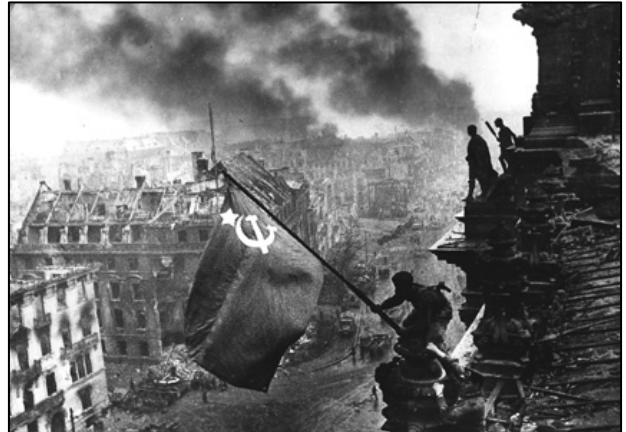
A Soviet soldier raises the USSR flag over Berlin