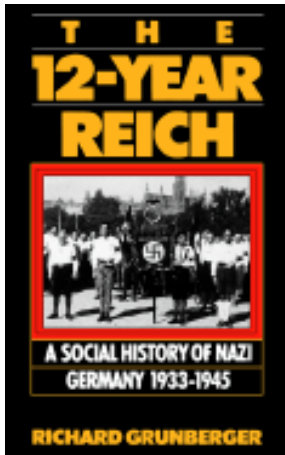
Hitler's Germany lasted a short space

Key Understanding: We have now studied the prophetic combinations in scripture of (a) World War II Germany /Cold War USSR vs. the United States, and (b) World War II Japan /Cold War USSR vs. the United States.