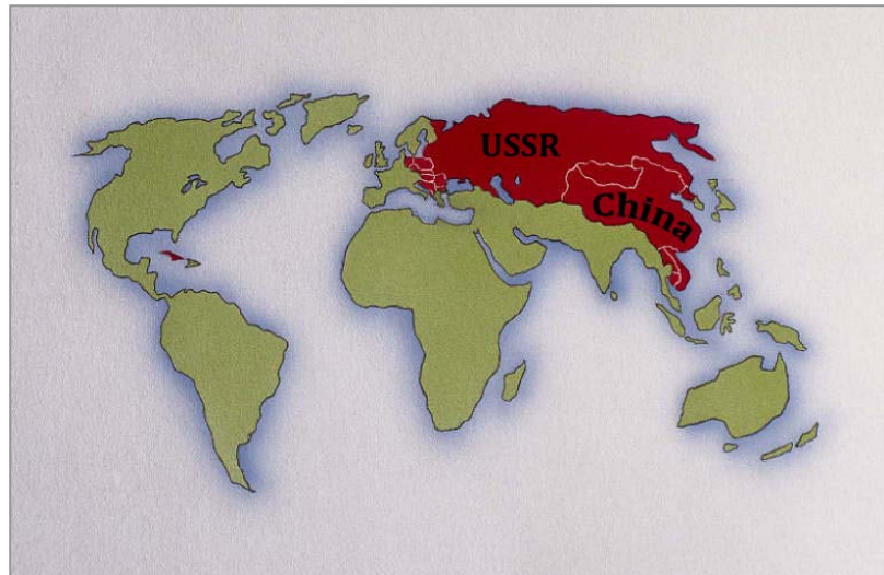
A world map showing the global spread of Communism during 20 th Century. Communist areas of Europe and Asia are highlighted in red.

Key Understanding: Red China as a twin, or double, of the USSR. During the Cold War era, Red China was looked upon by most of the world as being a twin, or double, of the 7 th Head Red USSR since both represented Red Communism. Both were also in the “east” in the East-West Cold War, and geographically located adjacent to one another. [As we have seen, Red China is a prophetic contender for the role of the Kings of the East in Revelation 16:12.] The USSR