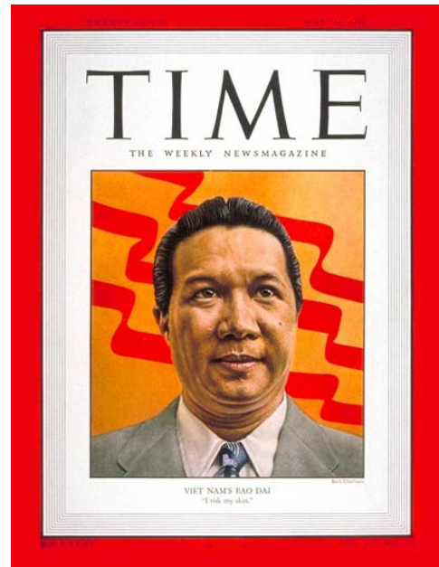
Emperor Bao Dai on the cover of Time, May 29, 1950

In response, on February 27, 1950, the United States announced its recognition of the State of Vietnam, which had been created through co-operation between anti-communist Vietnamese and the French government on June 14, 1949. Emperor Bao Dai took up position as Chief of State.