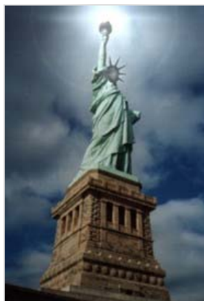
Liberty Enlightening the World

Key Understanding: The enlightenment as ‘the light of the world.’ How the whole world has been led astray is through the world accepting the philosophy of men as the truth of God, and specifically by the