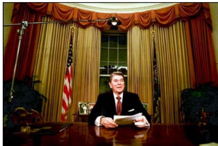
President Ronald Reagan delivers his ‘City on a Hill’ farewell address on January 11, 1989

Key Understanding: The shining city upon a hill. Ronald Reagan’s final words in his Farewell Address to the nation as he departed office in January 1989 emphasized America as being a “shining city upon a hill.” His words were exciting and powerful and brought chills to patriotic Christians in America, but they actually represented the seduction of false doctrine, and were a counterfeit of Matthew 5:14.