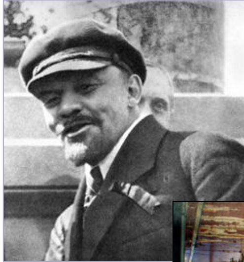
Lenin at the ceremony of laying the foundation stone of the "Emancipation of Labour" monument in 1920