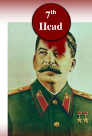
Cold War The Soviet Union death of Soviet Communism

[The wounding of triple 7 th Heads appeared on Unsealing #400 .]