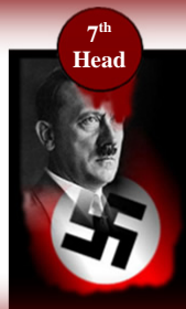
World War II Germany death of Fascism