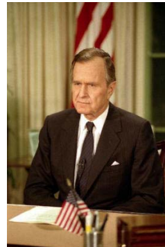
George H. W. Bush – Cold War Defeated the 7 th Head Soviet Union