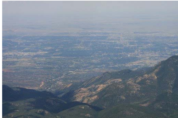
The view from Pikes Peak toward the plains

Oh beautiful, for spacious skies, For amber waves of grain, For purple mountain majesties Above the fruited plain! America! America! God shed his grace on thee, And crown thy good with brotherhood, from sea to shining sea.