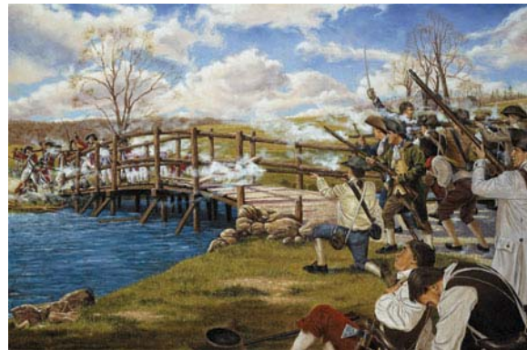
The Shot Heard 'Round the World, Concord, Massachusetts, April 19, 1775

The spiritual/prophetic reason for the Revolutionary War beginning at Concord, Massachusetts. The spiritual/prophetic reason for the Lord ordaining the Revolutionary War to begin at Concord, Massachusetts, has much to do with 2 Corinthians 6:15 (KJV).