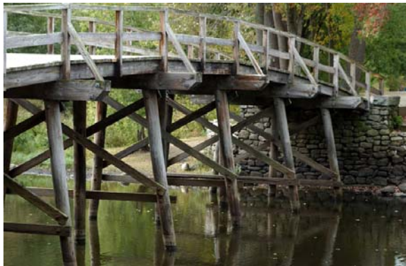
Old North Bridge in Concord, Massachusetts

Lieutenant Colonel Francis Smith were ordered to march from Boston and capture military supplies that were reportedly stored by the colonists' Massachusetts militia at Concord.