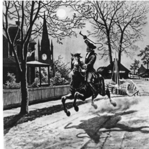
Paul Revere's ride

Charles River. At dawn the British forces arrived at Lexington Green, where ensued the first battle of the Revolutionary War. The British column then advanced to Concord. Militia and Minutemen from all surrounding towns had marched toward Concord.