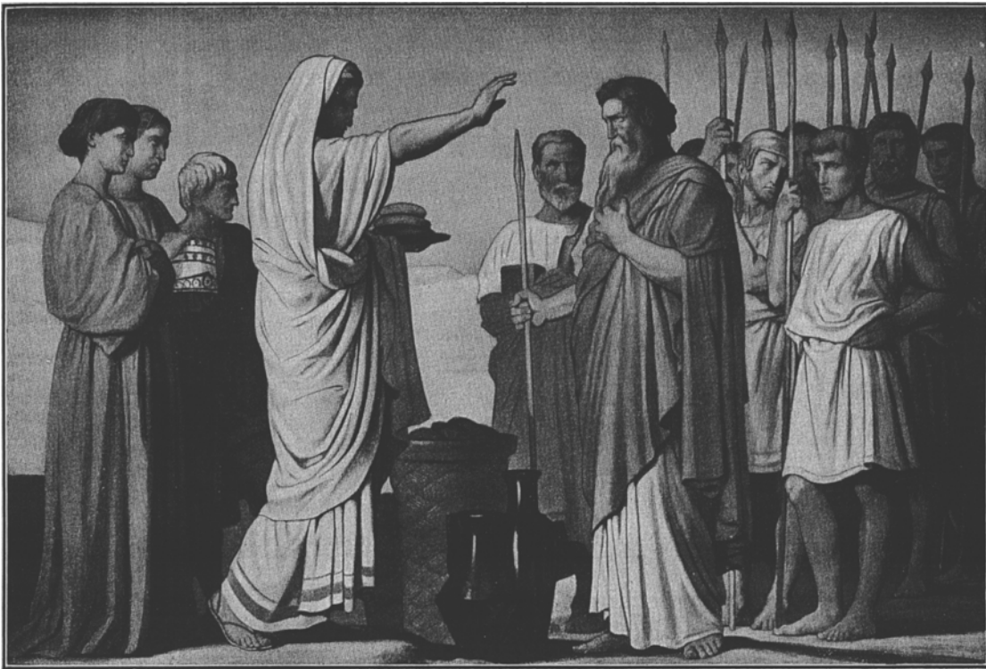
Depiction of Melchizedek blessing Abraham, Genesis 14:18-19, after Abraham had rescued Lot. This picture was chosen for this Unsealing because the number of spears shown in the picture happens to be thirteen (13).

[Chedorlaomer defeated the kings of Sodom and Gomorrah, and carried off Abram's (later, Abraham's) nephew Lot and his possessions, as Lot was living in Sodom. Abram then pursued Chedorlaomer, defeated him, rescued Lot, and recovered the goods.]