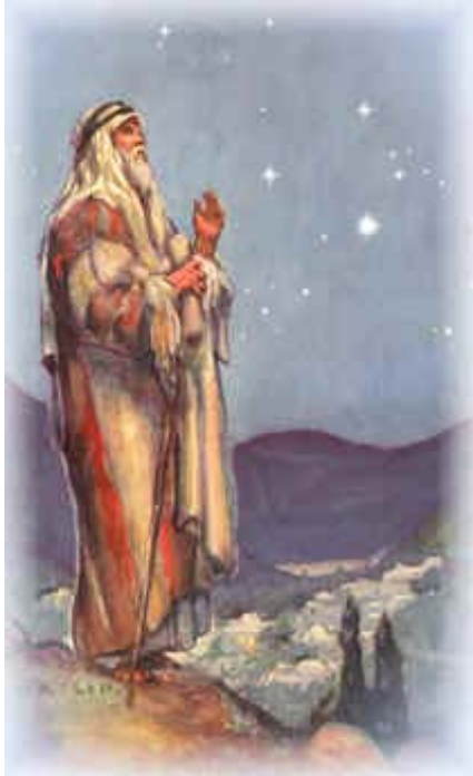
Abraham had his eyes on heaven

Key Understanding: The difference between Abraham and Lot. Since (i) Abraham made his home in the promised land as a sojourner (Hebrews 11:9) with his faith representing the true heavenly kingdom church – for he was looking forward to the Heavenly Jerusalem (Hebrews 11:10) – while (ii) Lot's downward decisions led him to wicked Sodom, Genesis 13 illustrates the separation of those who are called to be (i) citizens of heaven (represented by Abraham ) from those who essentially are (ii) citizens of the earth (represented by Lot ). Abraham had his eyes on the city of Heavenly Jerusalem (Hebrews 11:10). Lot had his eyes on the city of Sodom (Genesis 13:10-12). As we will cover, this contrast between the city of Heavenly Jerusalem and the city of Sodom is a part of the spiritual/prophetic story of the Original Thirteen (13) States.