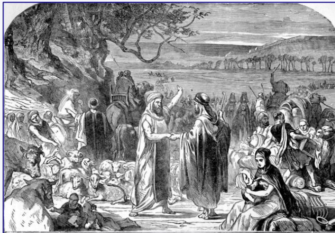
The parting of Abraham and Lot, Genesis 13:8-12

13 But the men of Sodom were wicked and sinners before the LORD exceedingly.