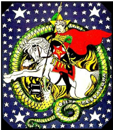
1918 Bolshevik propaganda poster depicting Trotsky as Saint George slaying the reactionary dragon of counterrevolution. Trotsky was People's Commissar of War, and organizer of the Red Army.

8, 1991, agreement to end the Soviet Union and create the Commonwealth of Independent States], and TRIED [in the counterfeit, referring back to Thomas Paine and These are the times that TRY men's souls , also seen in Revelation 3:10 in the letter to the Church in Philadelphia]; but the wicked shall do wickedly: and none of the wicked shall understand; but the wise shall understand.