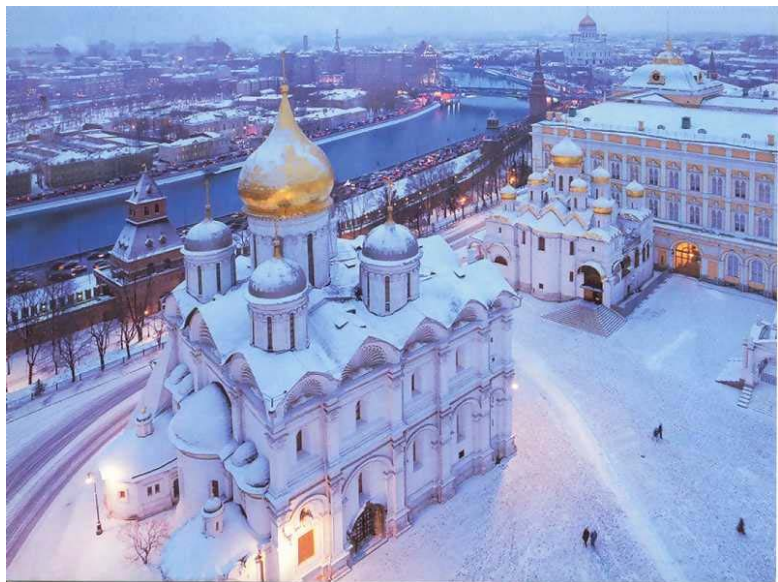
Cathedral of Archangel Michael at the Kremlin in Moscow

In Moscow itself, the Archangel Michael's Cathedral has been the burial place of Moscow Princes and Tsars up until the time of Peter the Great (the early 1700's). The tombs of Ivan the Great (Ivan III) and Ivan the Terrible (Ivan the IV) and of others of the Rurikovich Dynasty are located there, along with tombs of rulers of the Romanov Dynasty, including its founder, Mikhail Romanov. [Remember, Peter the Great built St. Petersburg, moving the capital of Russia from Moscow to there. Thereafter, what is known as Peter and Paul Cathedral in St. Petersburg – still attached to the Orthodox faith – became the burial place for most of the Romanov Dynasty.]