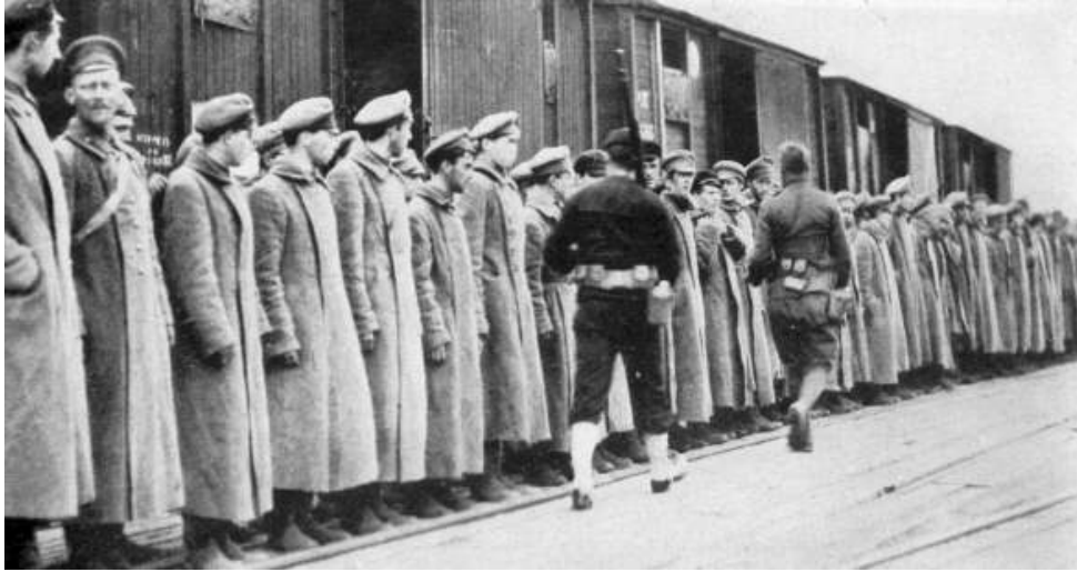
Bolshevik prisoners under the custody of U.S. troops in Archangel

[Sources for the above paragraphs, (1) Trotsky: A Photographic Biography , by David King, p. 82, © 1986; (2) A History of the Modern World , by R.R. Palmer, Joel Colton, p. 710, © 1978; (3) A Concise History of World War I , prepared for The Encyclopedia Americana, p. 305-306, © 1964. The above is consolidated from chart 1879, tape #25, titled Archangel , of the John Calvin Series .]