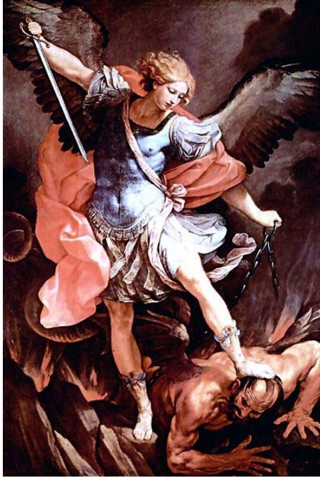
The Archangel Michael, painted for the Capucins' Church in Rome by Guido Reni (1575-1642)

the Tree of Knowledge of Good and Evil that the Americans and British, as a part of the White Army, were righteously fighting on the side of the Lord and Michael the Archangel, against Satan and his Red Bolsheviks.