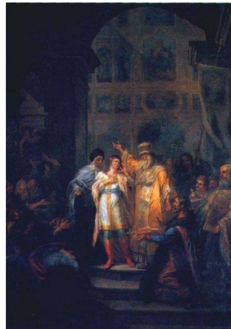
Painting by Grigory Ugryumov of the 16 year-old Mikhail being offered the crown at the Ipatiev Monastery in 1613