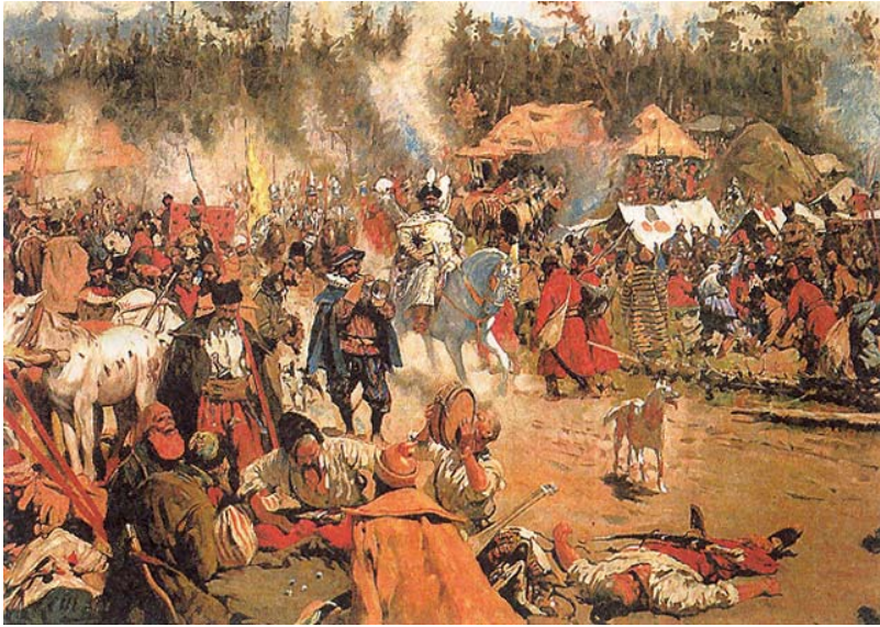
False Dmitry II's camp at Tushino

Tsar Vasili Shuisky, growing desperate, formed an alliance with Sweden, which sent its army into Russia and shattered the Felon's troops, ending his 13-month siege of the St. Sergius monastery. The years that immediately followed saw Tsar Vasili deposed, the death of the Felon, and several foreign claims to the throne, including one from Poland and two from Sweden. In 1610, Poland would actually occupy and control Moscow.